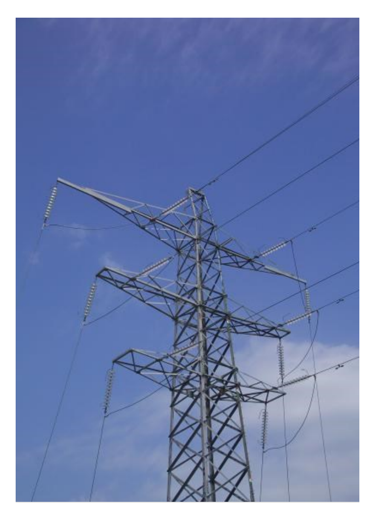
Jammu & Kashmir Power Transmission Corporation Limited (JKPTCL)

BUSINESS PLAN & MYT FOR THE PERIOD FY 2023-24 TO FY 2025-26 & TARIFF PROPOSAL FOR FY 2023-24